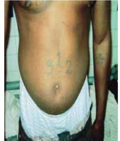
Photo 174: "312" a symbol to the associated with the TOWERSIDE gang