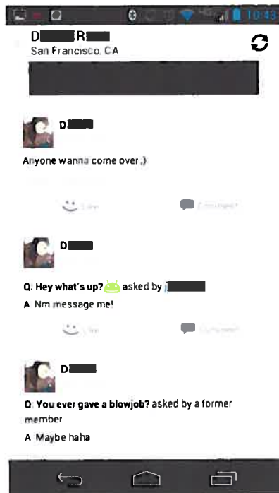
17 Screenshots Of Chats Viewable By Clicking On A Thumbnail Image In "Locals"

15 22. These publicly viewable chats not infrequently include questions about what 16 pornographic pictures a teenage girl would be willing to send or other graphic sexual content.